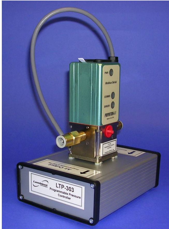
Figure 1 LTP-303 Programmable Pressure Controller