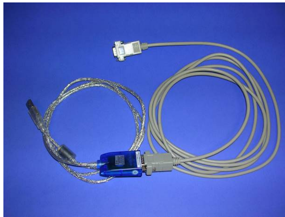
Figure 3 Included RS-485 to USB adapter and null modem cable