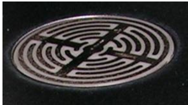
Figure 2: Ceramicomb-1™ electrodes

Dielectric and thermocouple signals are routed through a 10-foot (3 m) long stainless steel conduit to high temperature connectors. Sensor and cabling are rated for operation up to 250 °C and are suitable for R&D, QA/QC and manufacturing applications with repetitive operations.