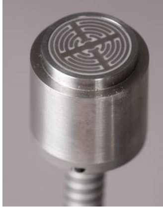
Figure 3 Close-up view of Carbon+Unitrode-1" sensor (rear exit version shown)

The Ceramicomb-1" may be used with all Lambient Technologies dielectric instruments in either mid-conductivity or high-conductivity mode. The sensor makes a surface measurement of material between the comb electrodes, shown close-up in Figure 3. The depth of measurement is approximately 0.020" (0.5 mm).