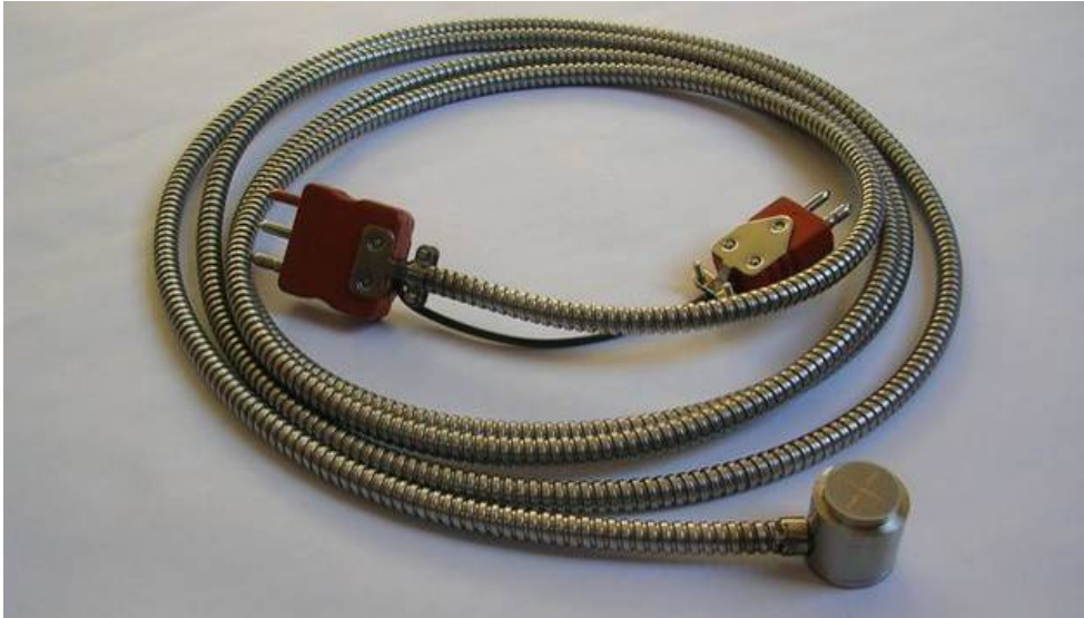
Figure 1 Ceramicomb-1™ Dielectric/Conductivity Sensor (Side exit version shown)