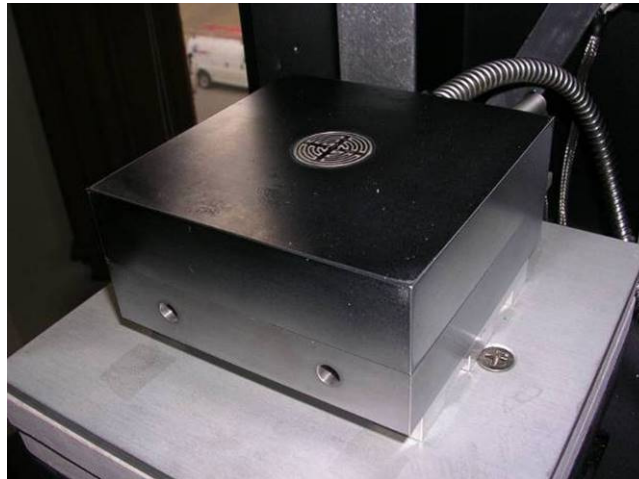
Figure 3: Ceramicomb-1" sensor in press platen

Thermocouple : Type J standard, Type K avail. upon request